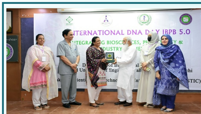
Acting Vice Chancellor SSUET presenting shield to Asst. Director (STI) PASTIC Karachi.