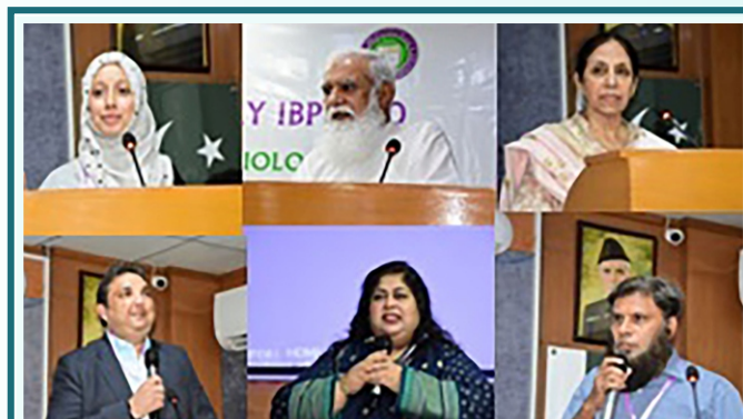
Keynote Speakers delivering presentations on DNA during Symposium.