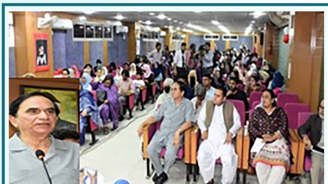
Registrar, SSUET addressing the Symposium with glimpse of the participants on "One-day symposium titled 'Integrating Biosciences' on International DNA Day" at SSUET Karachi.

ences' on International DNA Day" featuring a project/poster competition on July 2, 2024 at SSUET, Karachi. The symposium featured a wide range of esteemed speakers and over 250 participants, including deans, faculty members, researchers and students.