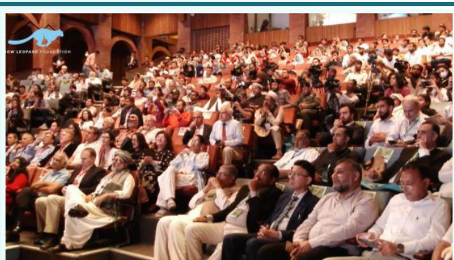
View of the participants of Pakistan Wildlife Protection Awards 2024 held on 31 July at PNCA, Islamabad.